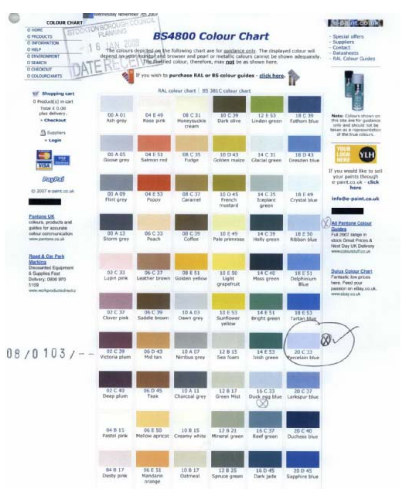
BRITISH STANDARD COLOUR CHART