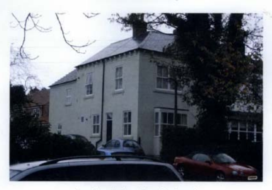
Corner house- Hartburn Village and Frasier road

EXAMPLES OF PROPERTIES WITHIN HARTBURN VILLAGE WITH VARIOUS COLOURED RENDERED WALLS.