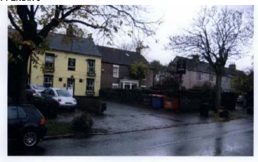
The Masham and 91 Hartburn Village